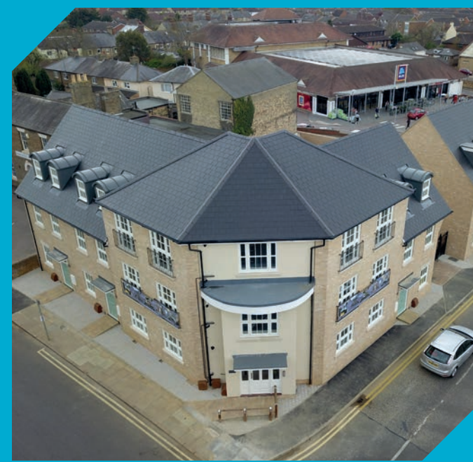
Three apartments and six town houses featuring Buff brickwork and joinery made timber windows and doors. LOCATION: Biggleswade DURATION: 42 Weeks

All our clients requirements and expectations are delivered on time and to the highest specification.