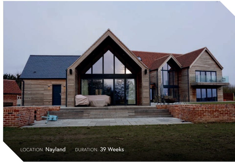
LOCATION. Nayland DURATION. 39 Weeks