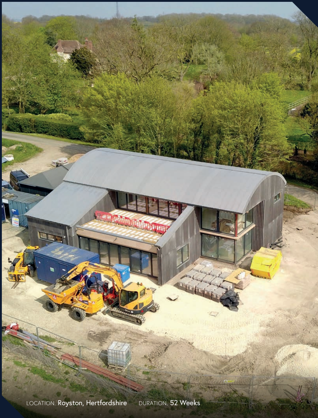
LOCATION. Royston, Hertfordshire DURATION. 52 Weeks