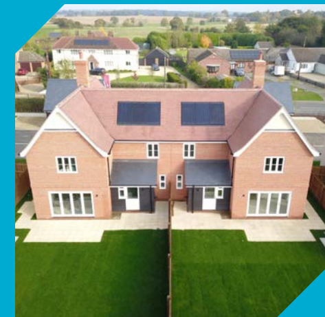
Two detached and two semi detached brick built homes each with four bedrooms. LOCATION: Newton, Suffolk DURATION: 28 Weeks