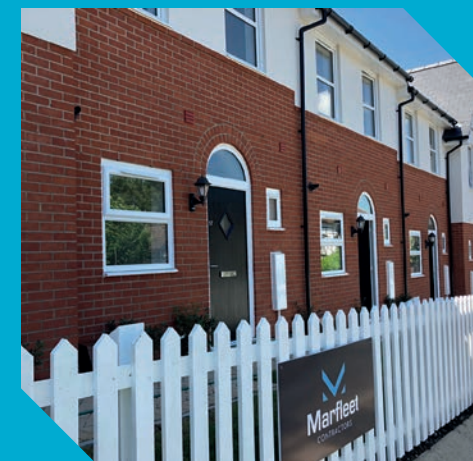
Nine, brand new two bedroom houses. LOCATION: Sible Hedingham, Essex DURATION: 36 Weeks