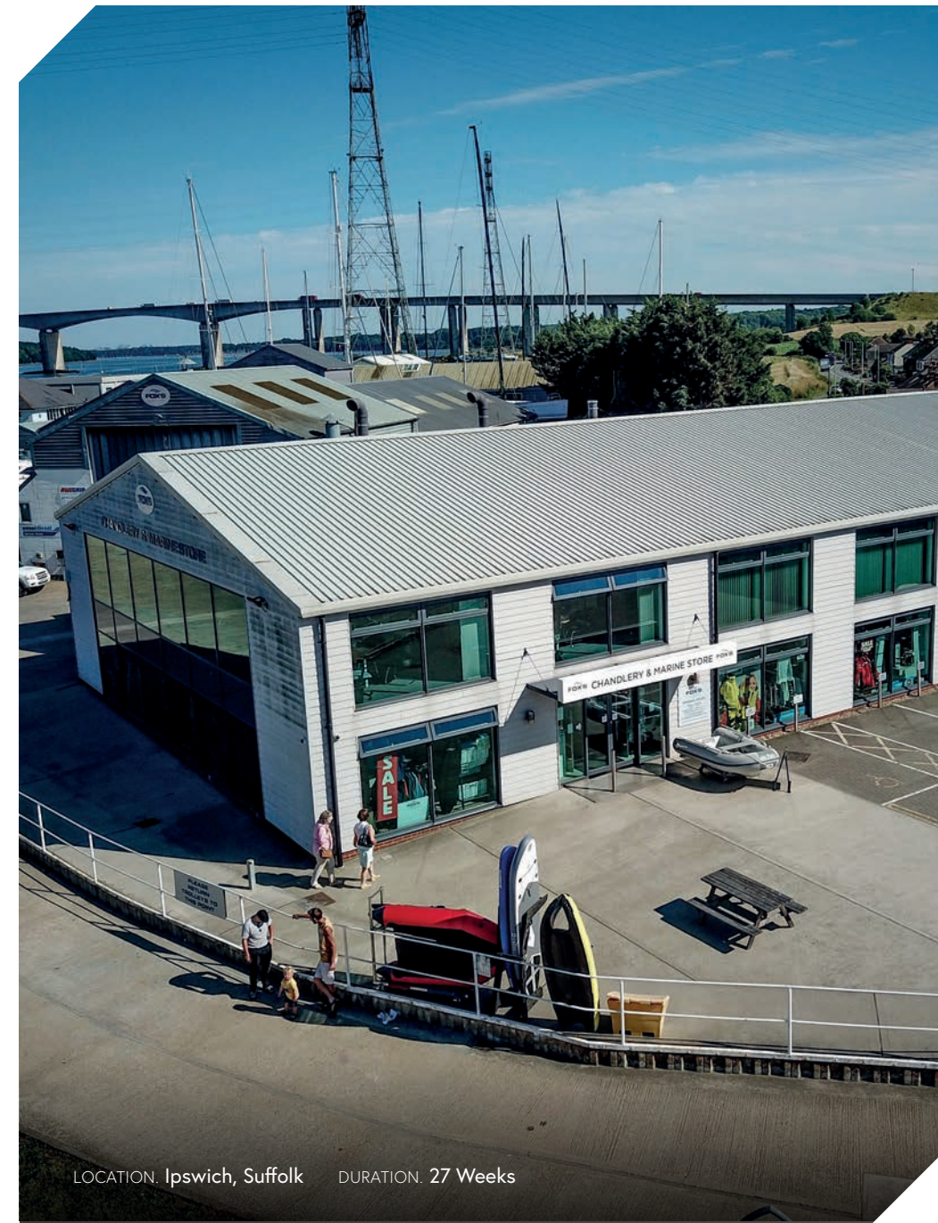
LOCATION. Ipswich, Suffolk DURATION. 27 Weeks