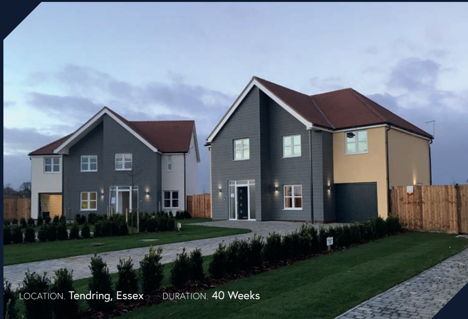
LOCATION. Tendring, Essex DURATION. 40 Weeks