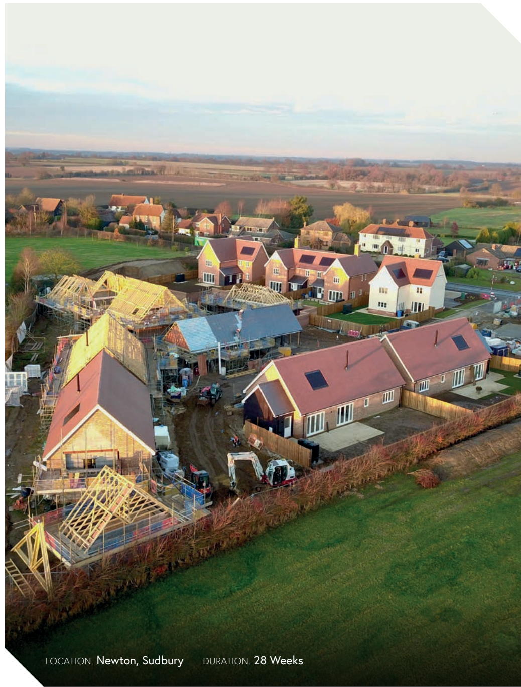
LOCATION. Newton, Sudbury DURATION. 28 Weeks