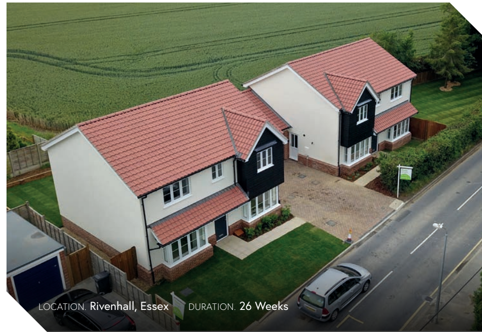
LOCATION. Rivenhall, Essex DURATION. 26 Weeks