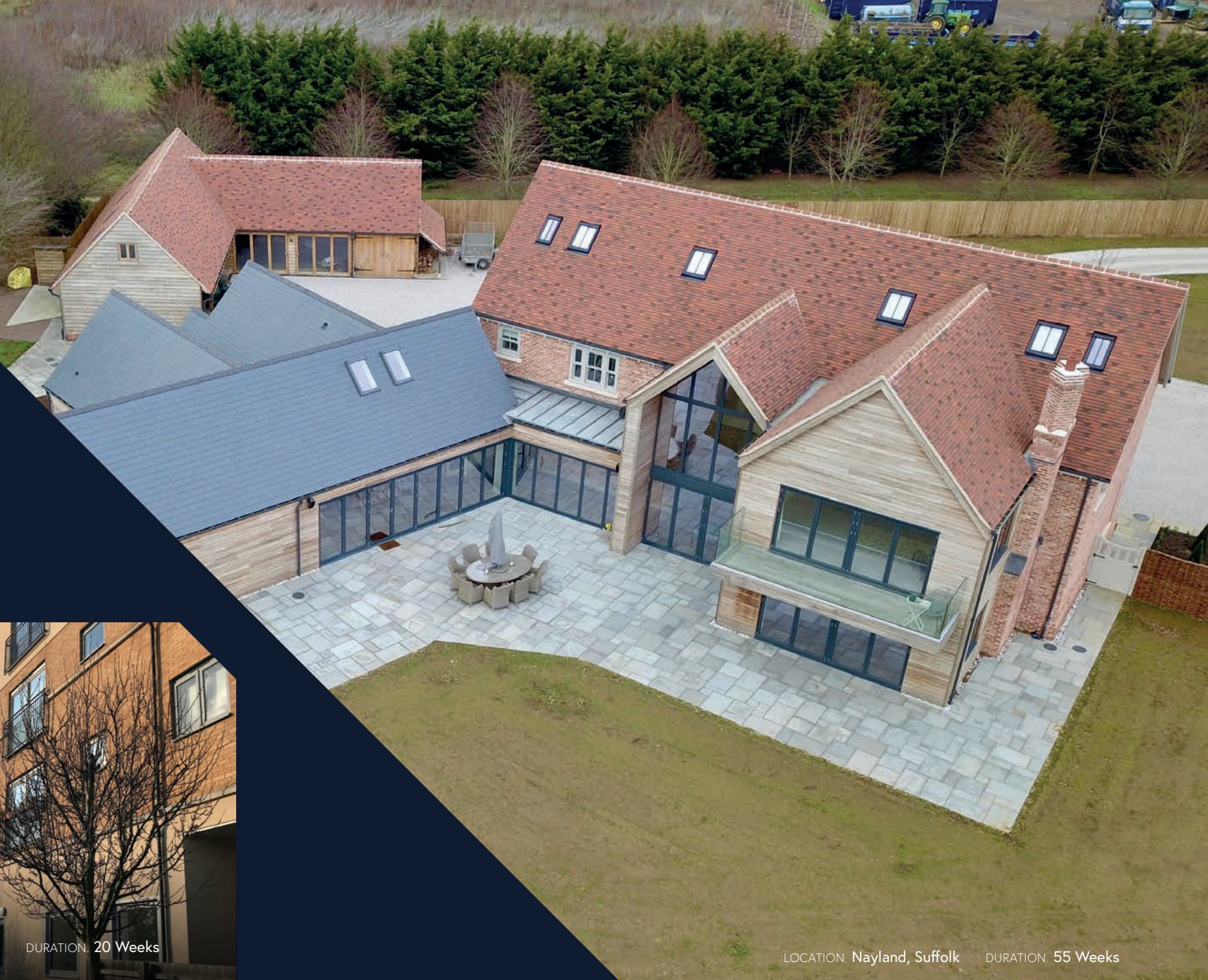
LOCATION. Nayland, Suffolk DURATION. 55 Weeks