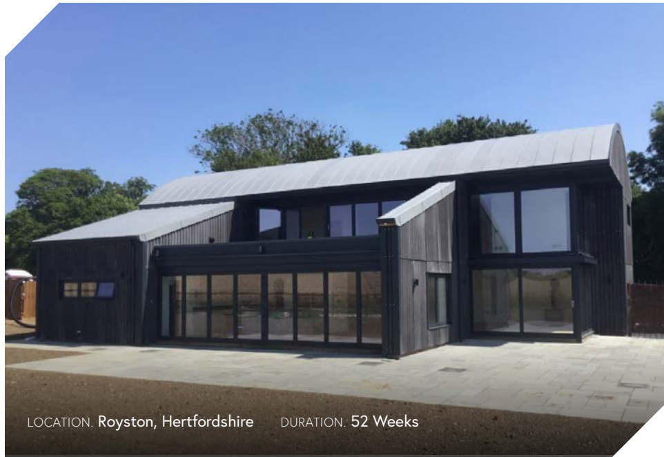
LOCATION. Royston, Hertfordshire DURATION. 52 Weeks