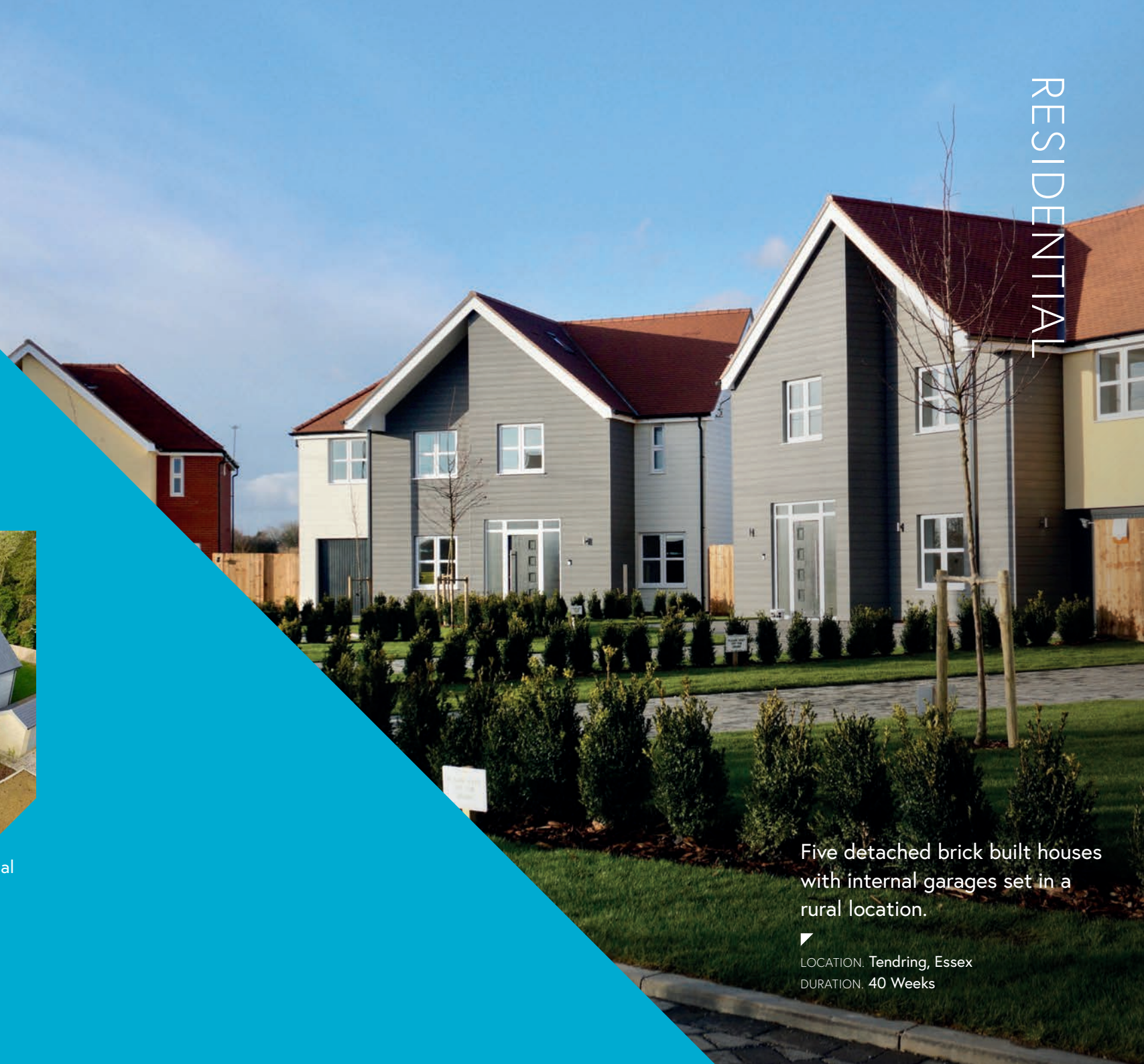
Five detached brick built houses with internal garages set in a rural location. LOCATION: Tendring, Essex DURATION: 40 Weeks