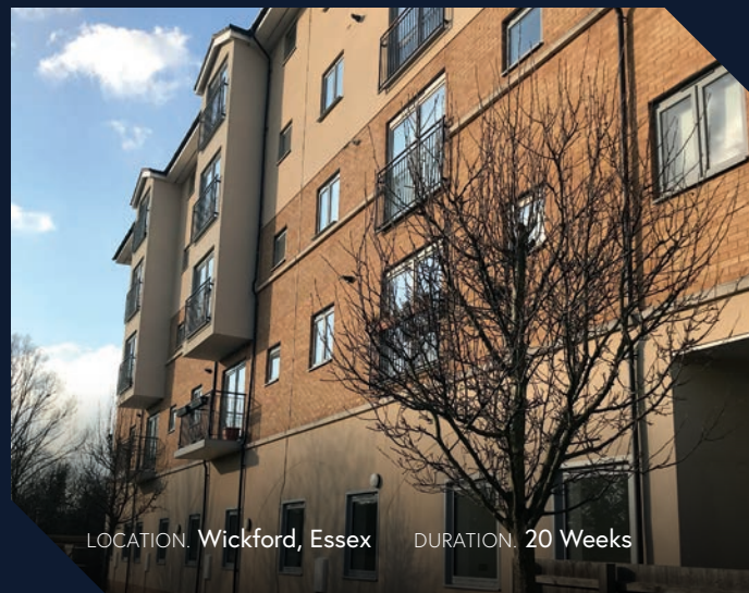
LOCATION. Wickford, Essex DURATION. 20 Weeks