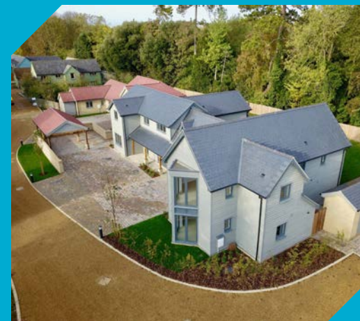
The project consisting of seven individual high specification homes. LOCATION: Fulbourn, Cambridgeshire DURATION: 39 Weeks