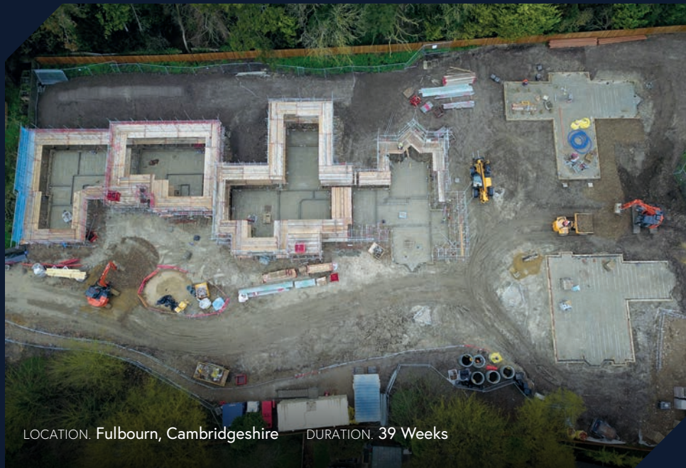
LOCATION. Fulbourn, Cambridgeshire DURATION. 39 Weeks